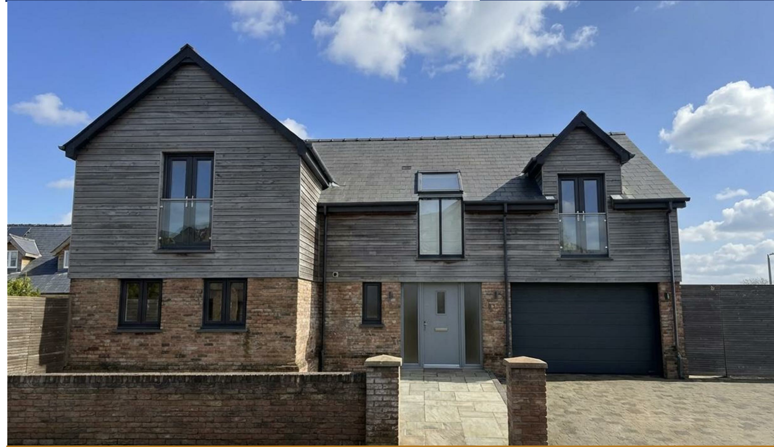
"1 Little Cedar Drive", Camrose, Haverfordwest, Pembrokeshire, SA62 6JS